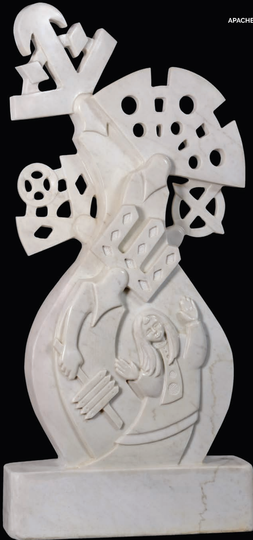
APACHE SUNRISE CEREMONY CARRARA MARBLE 48" x 24" x 7"