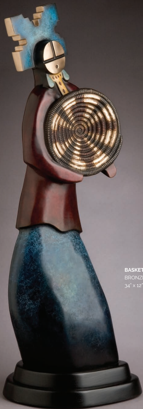
BASKET MAKER BRONZE 34" x 12" x 8"