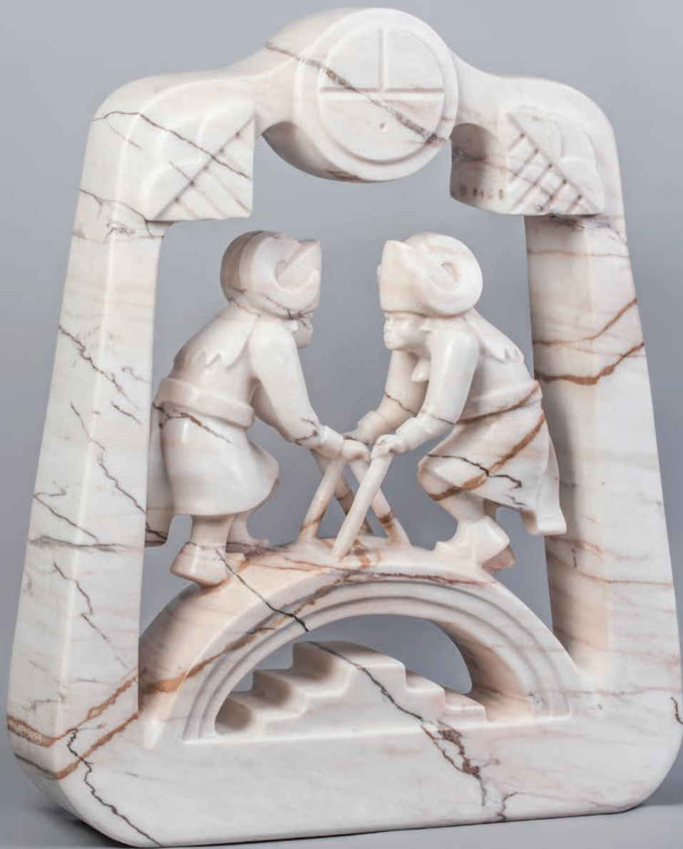
SANTA CLARA PUEBLO RAM DANCERS PORTUGUESE MARBLE 38" x 28" x 10"