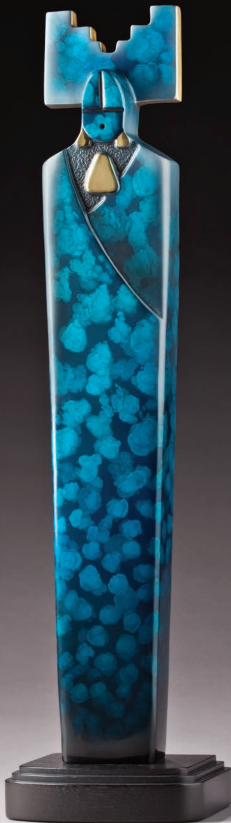
BLUE CORN BRONZE 28" x 7" x 6"