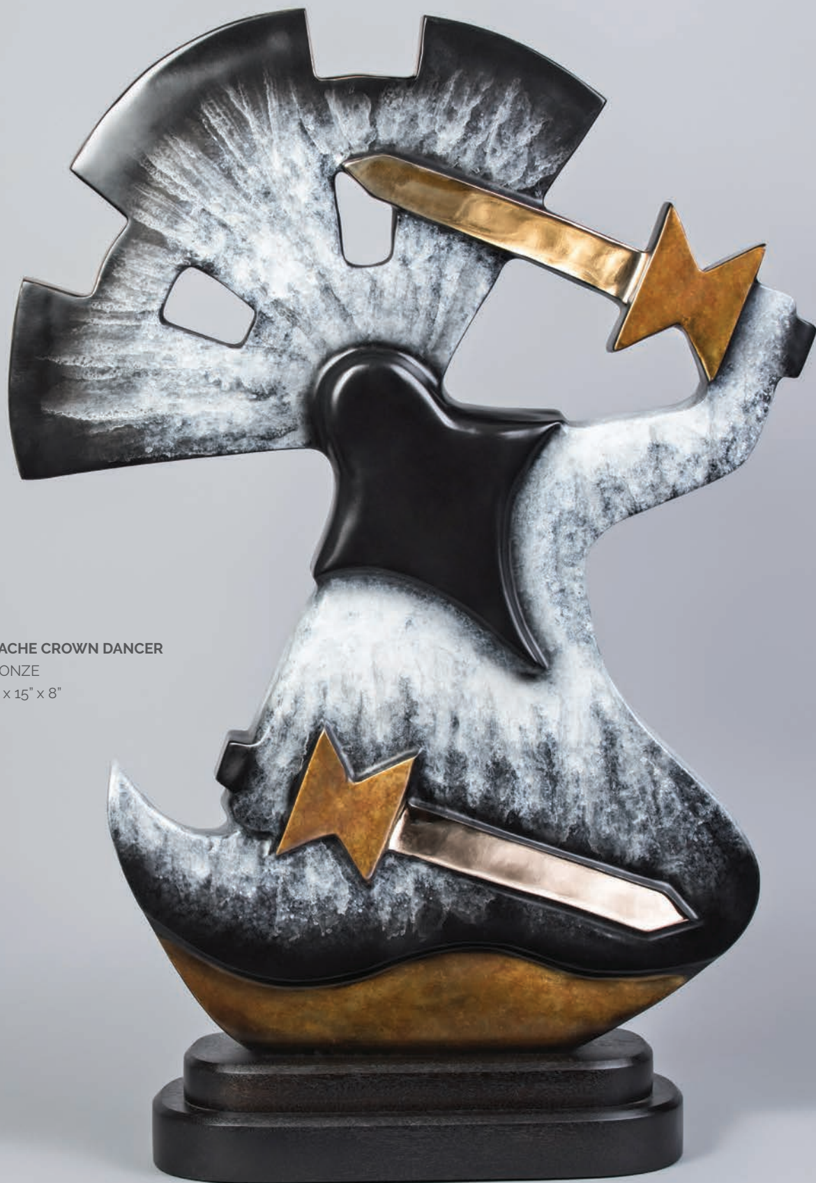
APACHE CROWN DANCER