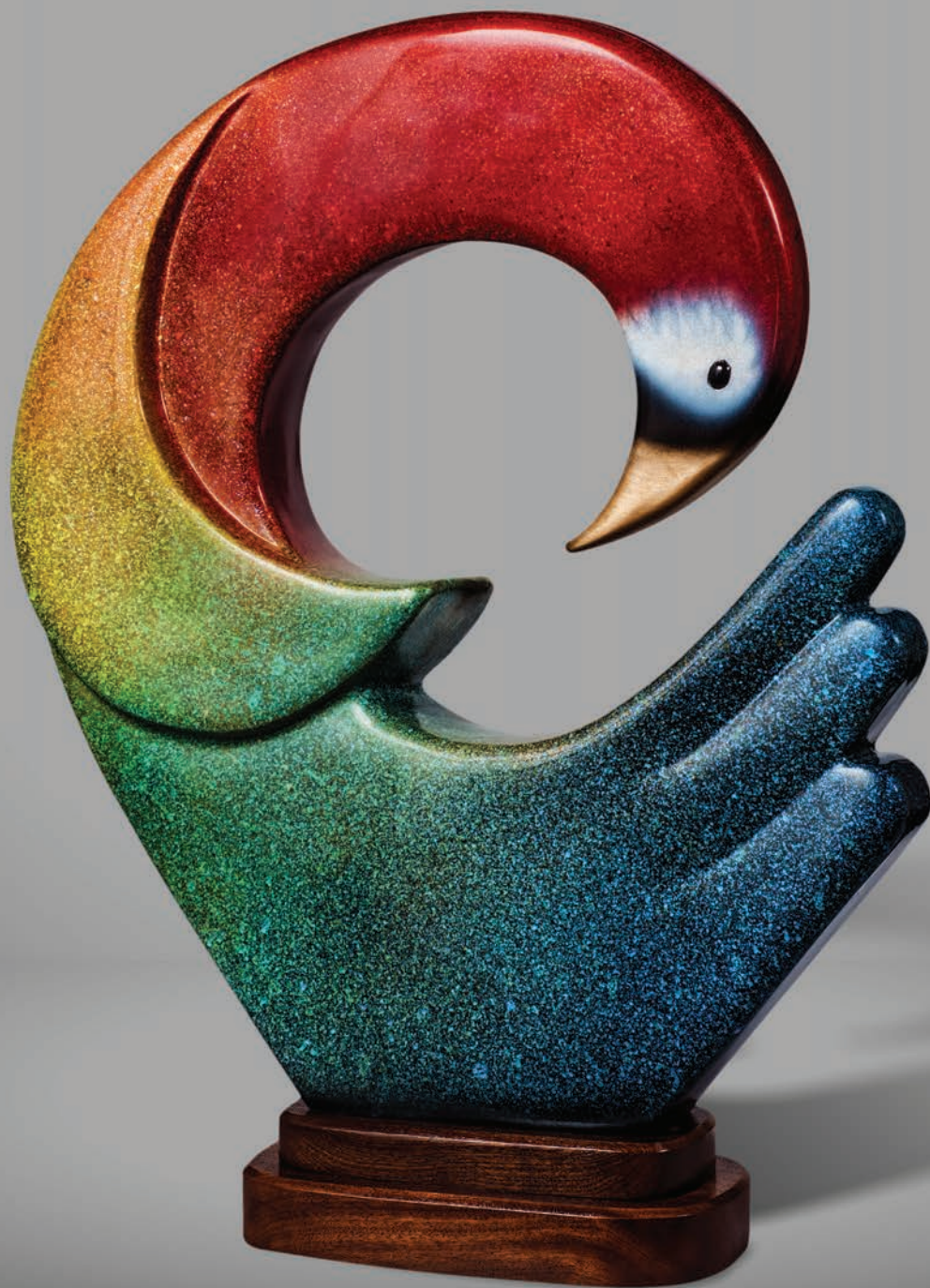
ANASAZI TSIDEH BRONZE 29" x 21" x 12"