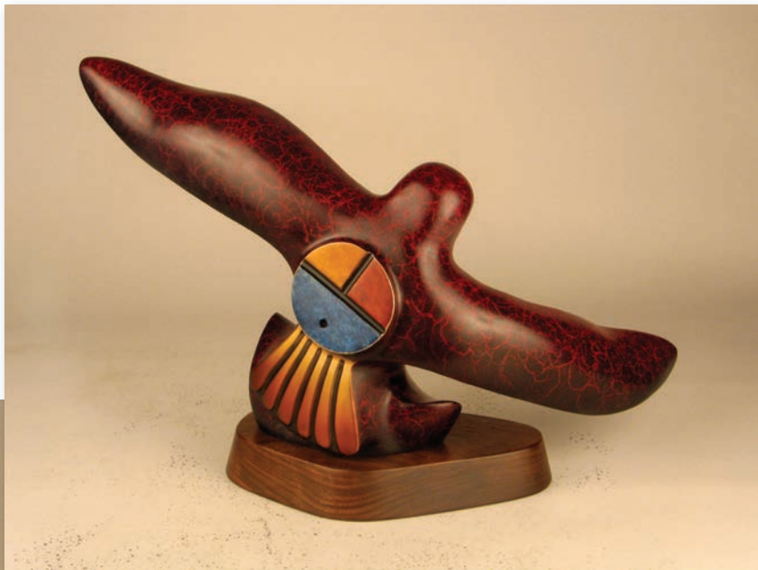
EAGLE DANCER BRONZE 14" x 21" x 9"