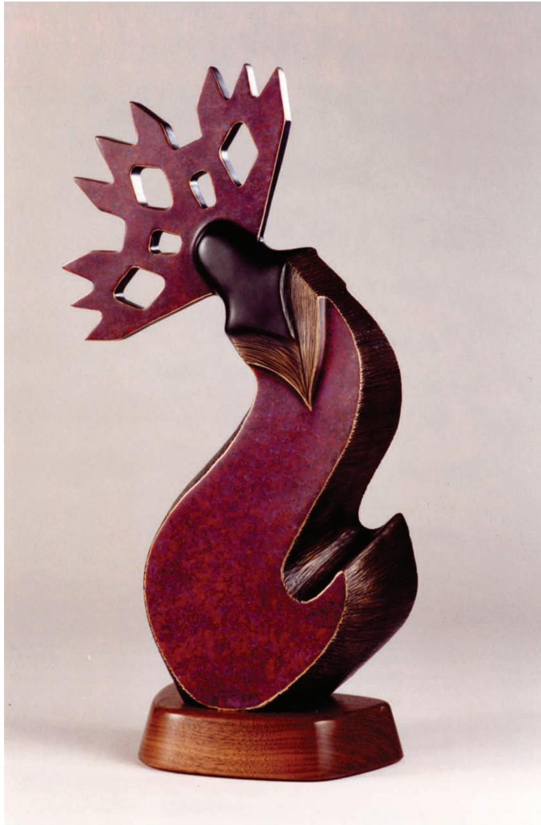
APACHE CROWN DANCER BRONZE 21" x 11" x 5"