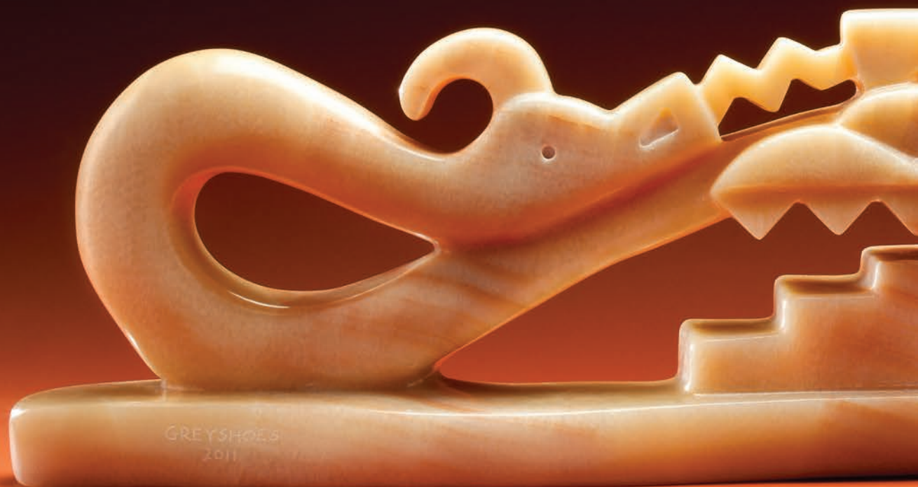
AVANYU - A PRAYER FOR RAIN PERSIAN ONYX 11" x 41" x 8"