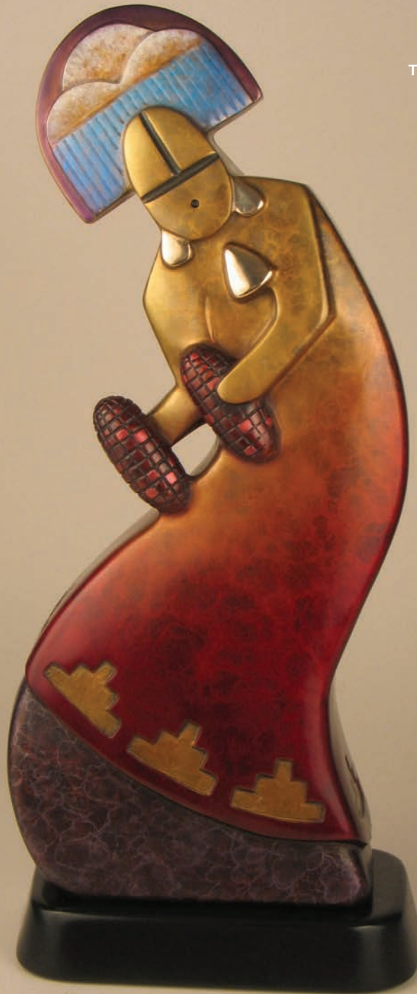
THE BLESSING BRONZE 25" x 11" x 6"