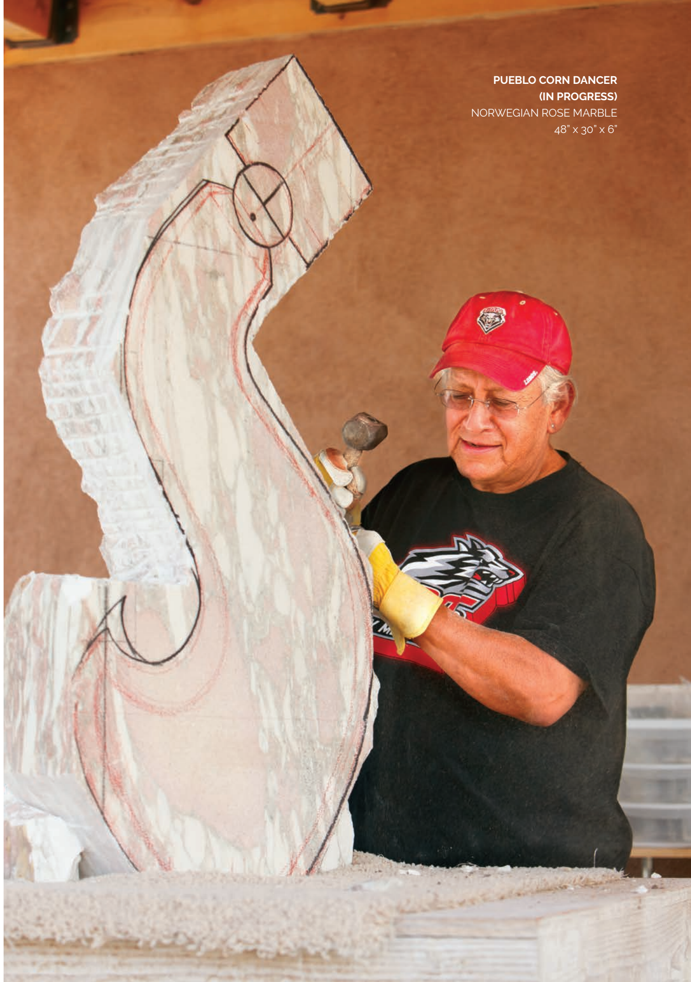
PUEBLO CORN DANCER (IN PROGRESS) NORWEGIAN ROSE MARBLE 48" x 30" x 6"