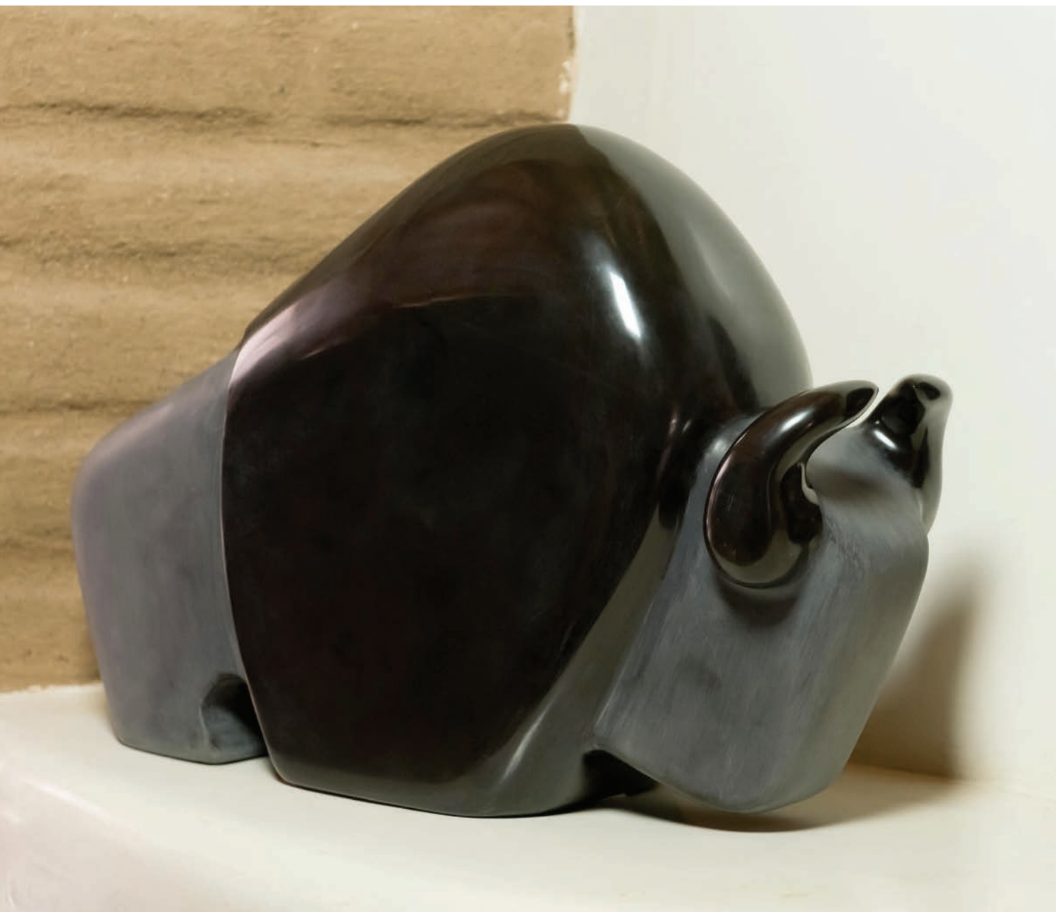
AMERICAN BISON II BELGIAN MARBLE 16" x 23" x 8"