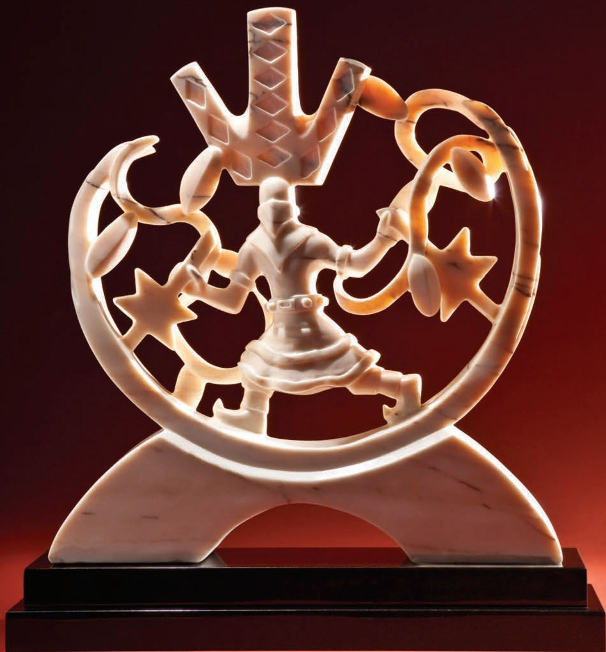
MOUNTAIN SPIRIT DANCER PORTUGUESE MARBLE 34" x 28" x 8"