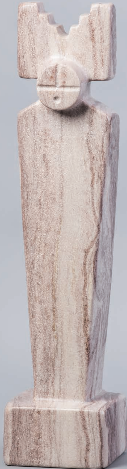
PUEBLO CORN DANCER UTAH ALABASTER 20" x 5" x 4"